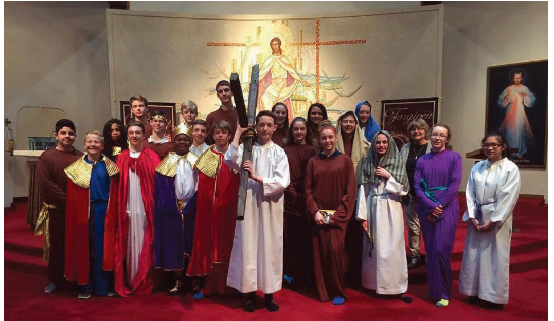
LIVING STATIONS OF THE CROSS : On April 12, the eighth-grade class presented the Stations of the Cross as the parish prepared for Easter Sunday.